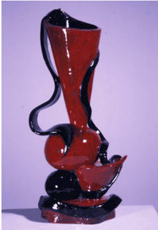
Jessica Diabal: "Red Vazz" Sculpture Ceramic, 2003